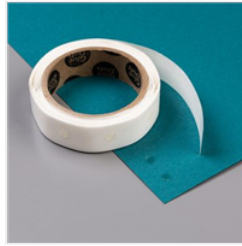
Glue Dots - 103683