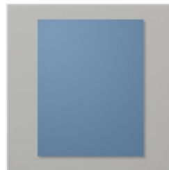
Misty Moonlight 8- 1/2" X 11" Cardstock - 153081