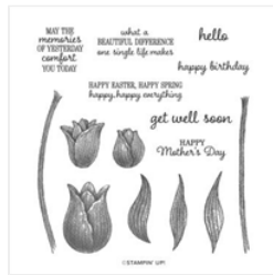
Timeless Tulips Photopolymer Stamp Set (En) - 151534