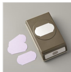
Timeless Label Punch - 149516