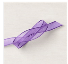
3/8" (1 Cm) Gorgeous Grape Sheer Ribbon - 154572