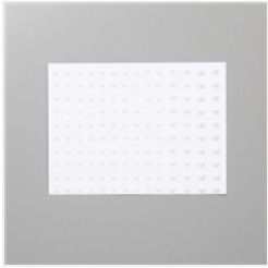
Pearl Basic Jewels - 144219

Terri Brumagim tbrumagim@msn.com https://terribrumagim1.stampinup.net/