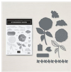
Hydrangea Haven Bundle (English) - 156251

Terri Brumagim tbrumagim@msn.com https://terribrumagim1.stampinup.net/