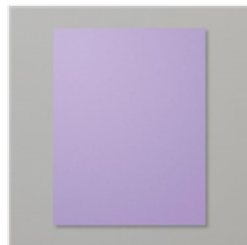
Highland Heather 8-1/2" X 11" Cardstock - 146986