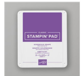
Gorgeous Grape Classic Stampin' Pad - 147099