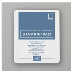
Misty Moonlight Classic Stampin' Pad - 153118