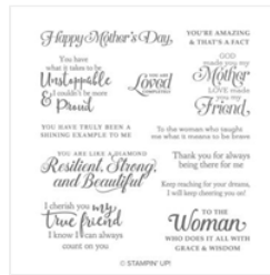
Strong & Beautiful Cling Stamp Set - 148732