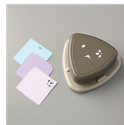
Detailed Trio Punch - 146320