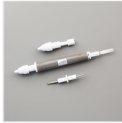
Take Your Pick - 144107