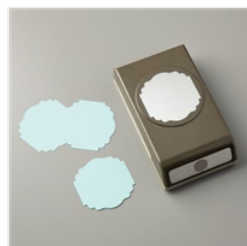
Label Me Lovely Punch - 151296